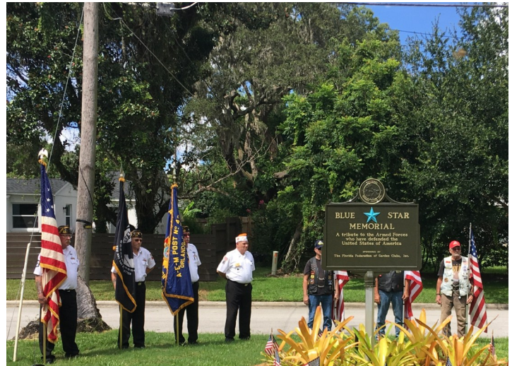
Representatives from the VFW, American Legion and Patriot Riders comprised the Color Guard