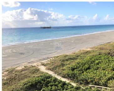
Beach Re-Nourishment Completed