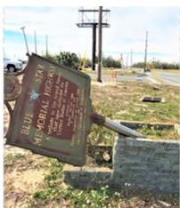
Parker, FL Blue Star Marker

On October 10th, 2018 a devastating Category 5 Hurricane Michael struck Florida's panhandle causing catastrophic wind and storm surge destruction as it moved onward to Georgia. The areas hardest hit largely were between Panama City and Port St. Joe, continuing northward across I-10 through Marianna. In terms of storm intensity, as measured by central barometric pressure at its Florida landfall, Hurricane Michael is second only to the 1935 Labor Day hurricane – even surpassing the Miami area's Hurricane Andrew in 1992.