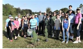
WGC Tree Planting Volunteers

calling together all their volunteers. They didn't disappoint. She was expecting about 20 people but instead had about 40 volunteers. WGC volunteers included some members from their Community Garden team and others, high school students and teachers from their sponsored youth gardens, Boys and Girl Scout youth and leaders, and Village of Wellington staff.