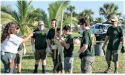
Boy Scout Troop 199

Taking advantage of a year-round growing season, Florida Garden Clubs got the jump on this initiative partnering with a variety of youth groups early in 2020. This is a winning strategy for community building and education. Our youth are eager to contribute positively to the future and they have been thrilled to get their hands dirty doing the planting—a key for Garden Clubs with older members. Parks and Recreation Departments and City governments provide the land—various park beautification efforts—and these groups also provide continued maintenance of the plantings until they are established. Local Garden Clubs have been the sponsors of the projects detailed below and have provided the fundraising. Garden School consultants have provided planting expertise along with native nursery staff, and they also secured the native plants at competitive prices. It takes a village!