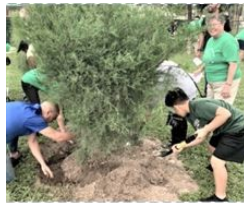
Greenacres C.A.R.E.S. Junior Garden Club Boy Scout Troop 199

Members of Greenacres C.A.R.E.S. Junior Garden Club and its club sponsor, Oleander Garden Club of the Palm Beaches, Florida, planted six varieties of native trees while participating in a Florida Arbor Day dedication. The dedication included city officials and members from the county parks department. Funds for the tree-planting project were obtained through monetary donations from local community members in memory of loved ones.