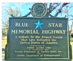
Parker, FL Blue Star Marker Restored