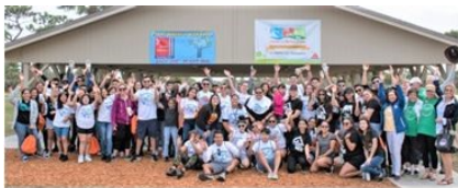
Latinos in Action

Seventy-three local high school students helped kick off the third celebration of Florida Arbor Day, gathering early on a Saturday to participate in reconciliation ecology—naturalizing a trail as part of an ongoing restoration project by Palm Beach County Parks and Recreation. The high school students, representing five area Latinos in