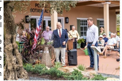
Port St. Lucie Botanical Garden Florida Arbor Day Celebration

In addition, members of Rio Lindo Garden Club in Port St. Lucie, area Master Gardeners and representatives of the Port St. Lucie Botanical Garden, as well as other local and state organizations, visited fourth-grade students at three area elementary schools to speak about Florida Arbor Day and the important role trees play in the environment. Also in attendance were representatives from "Keep Port St. Lucie Beautiful," a community beautification initiative and an affiliate of Keep America Beautiful, which engages individuals through education, responsibility, public and private partnerships and volunteer action.