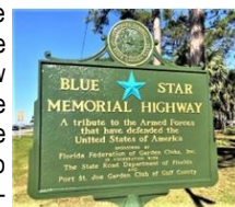
Port St. Joe, FL Blue Star Marker Restored

pleased to report that the three markers at Parker, Port St. Joe and Tyndall AFB now have new support posts and their face plates have been restored to like new condition. In addition, two other orphaned markers in Chattahoochee and Cottdonale have been similarly refurbished as well as the marker for the Marianna Garden Club.