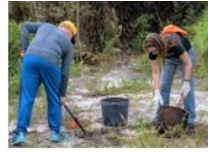
Latinos in Action

Action organizations, restored habitat in a naturalized area of the park by planting several varieties of native plants, including several live oaks. A special treat—endangered Gopher Tortoises were spotted along the trail—an excellent sign reconciliation ecology is succeeding!