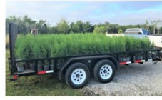
Southern Red Cedars

What an amazing, beautiful day Wellington Garden Club had on Saturday, February 15, 2020 while planting almost 1500 native Southern Red Cedar ( Juniperus silicicola ) tree seedlings in the Wellington Environmental Preserve on Flying Cow Ranch Road. This was a special tree planting in addition to their annual September tree planting usually held on National Public Lands Day. They were fortunate to be able to hold this special planting because the Village of Wellington had an abundance of seedlings that were purchased and needed to be planted. Even with only a short notice the event organizer, Kathy Siena, thought the club members and the community could help by