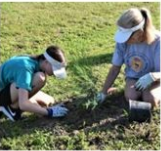
Volunteer & Granddaughter

The National Garden Clubs "Plant America-Plant Trees" challenge set before local garden clubs was picked up and carried forward by WGC! President Trump in his State of the Union address declares the "United States will join the One Trillion Trees Initiative, an ambitious effort to bring together government and the private sector to plant new trees in America and around the world." (from editorial by Andrew Wheeler-EPA Administrator) WGC is doing their global duty as earth stewards in the private sector by planting new trees.